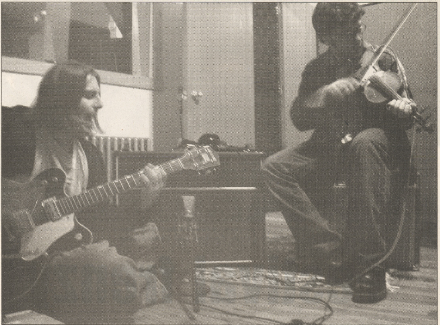
The Punters' fourth album, Fishermen's Blues , is much more traditional than previous efforts.

we want you to do this or that. It was free and easy. Avondale gave us free creative control of the album and we give them full marks for that."