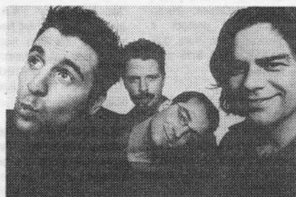
Great Big Sea were one of the first artists to sign on to Avalon Music's The Christmas Wish CD project. The band performs Seven Joys of Mary on the new disc.